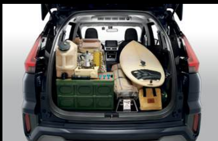
2 nd & 3 rd Row Seat Fold Flat