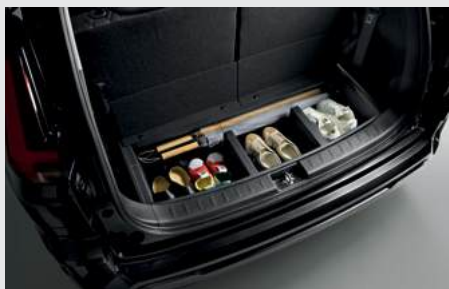
Cargo Floor Box with Lid

Visuals shown are for illustration purposes only. Specifications may vary according to variant/market. Please consult your local Mitsubishi Motors dealer for more information.