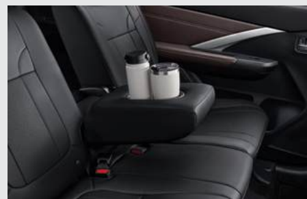
[NEW] 2 nd Row Arm Rest with Cup Holder