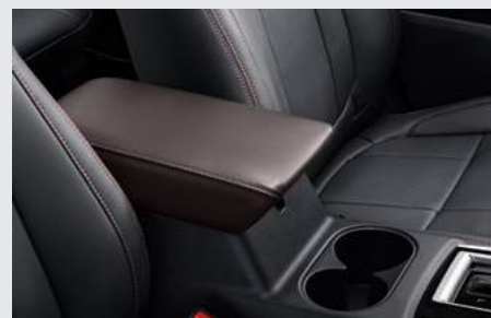
[NEW] Leatherette Center Console Arm Rest