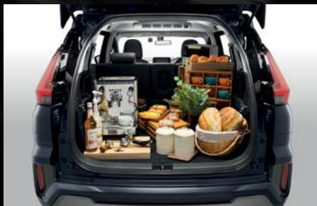
3 rd Row Seat Fold Flat & 2 nd Row Seat Half up