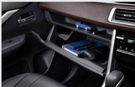
Glove Box with Double Compartment