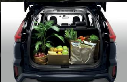
2 nd & 3 rd Row Seat up