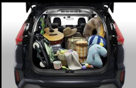
3 rd Row Seat Fold Flat