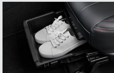
Underseat Multi-purpose Storage