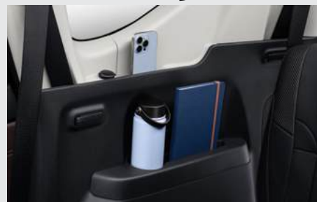
3 rd Row Side Pocket & Cup-holder