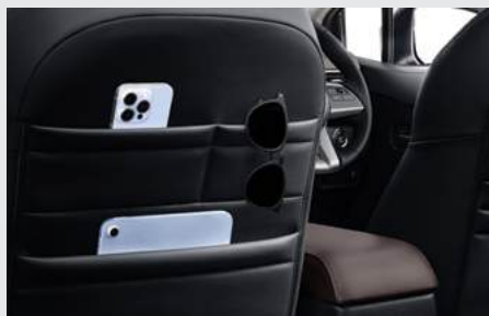
2 nd Row Smart Pocket Storage