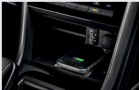
Front Console Tray with Card Holder & Storage